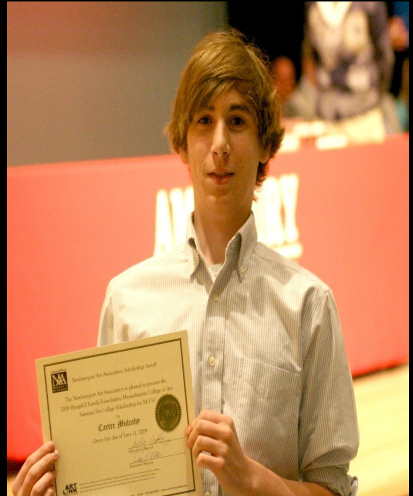
Newburyport Art Association award to Mass College of Art summer program